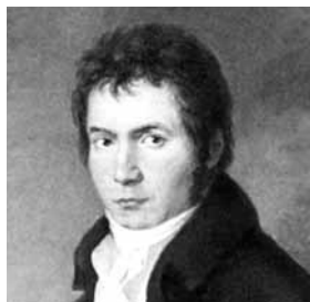
Ludwig van Beethoven Born in Bonn, probably December 16, 1770 Died in Vienna, March 26, 1827

At age 16 Beethoven left his native Bonn to go to Vienna in the hopes of studying with his idol, Mozart. He is said to have played for him and allegedly earned his approving remark, "Keep your eyes on him; someday he will give the world something to talk about." Beethoven was soon called home, however, to tend to his gravely ill mother and remained in Bonn for the next five years. In 1792, with assistance from the Elector Maximilian Franz and Count Waldstein, Beethoven won the chance to return to Vienna. Mozart had recently died and Haydn would be his teacher. Waldstein informed Beethoven, "With the help of assiduous labor you shall receive Mozart's spirit from Haydn's hands. "