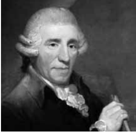
Franz Joseph Haydn Born in Rohrau, Lower Austria, March 31, 1732 Died in Vienna, May 31, 1809

Franz Joseph Haydn's reputation as the “Father of the Symphony” registers a historical stature that trumps chronological accuracy. In other words, while he hardly invented the genre, Haydn was undoubtedly the one who made symphonies really matter. He composed at least 106 of them.