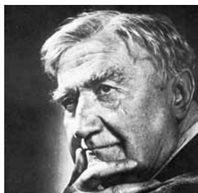
Ralph Vaughan Williams Born in Down Ampney, Gloucestershire, October 12, 1872 Died in London, August 26, 1958

"I met Willy Walton on my way to the Hall and he said—having been to rehearsals—that we are going to hear the greatest symphony since Beethoven," wrote the composer Arthur Benjamin just before the premiere of Vaughan Williams's Symphony No. 4 in F minor. Walton's casual comment is insightful because he shrewdly coupled Vaughan Williams's Symphony with the formal logic and emotional intensity of Beethoven. At its first performance by Adrian Boult and the BBC Symphony at Queen's Hall, London, on April 10, 1935, most listeners and critics sat stunned by the uncompromising Modernism of the score. Walton, however, had the cool discernment to recognize that the Fourth Symphony was an example of Vaughan Williams's ambivalent engagement with the Beethovenian symphonic tradition.